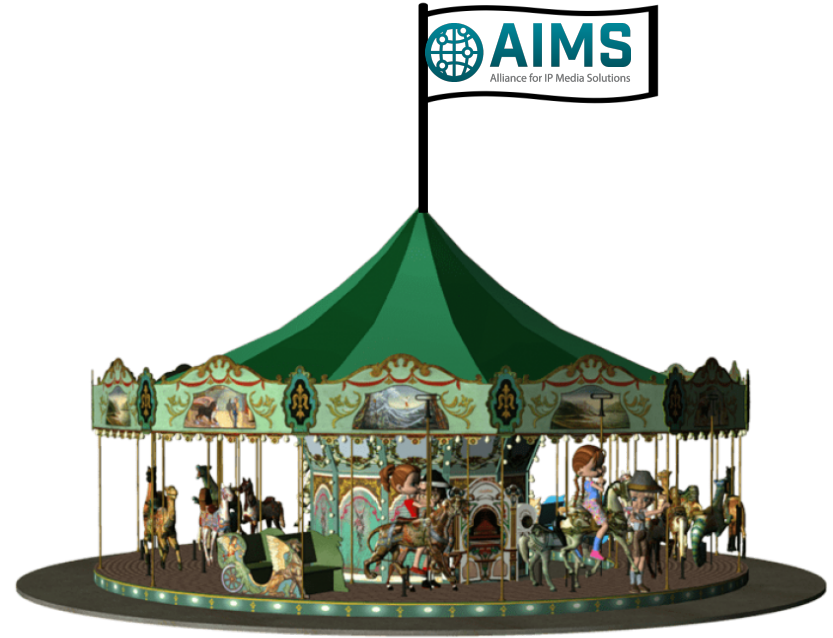
IP Media Networks Today