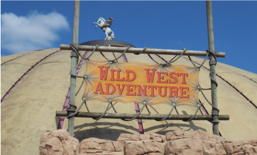
The Early Days of IP Media Networks